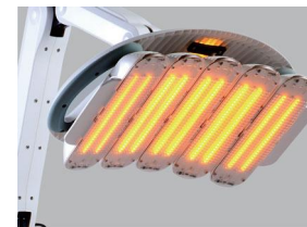
830 nm with 590 nm photosequencing

With three available treatment heads, there is one that is right for your treatment needs. Ask your doctor which Healite II wavelength is right for you.